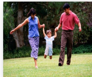
The purpose for our calling

information and confirm the care that is provided for their children. The reporting and claim submission process currently used will become automated for both the parent and child care provider. Contact your local R&R for more information and training. Visit the Department of Human Services website at http://www.state.nj.us/humanservices/dfd/programs/child/ecctraining.html