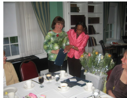
We appreciate members

The general membership will be invited to other events. If you are interested in committing to work on the board and attend meetings, we want to get to know you!