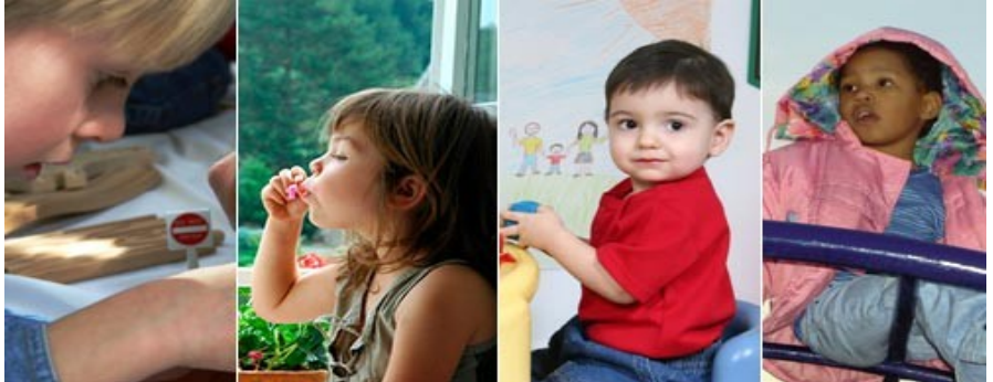
Kenyon's Main Focus

ful organization and the impact we can make in the early childhood field. We hope to see you soon at upcoming Kenyon events!